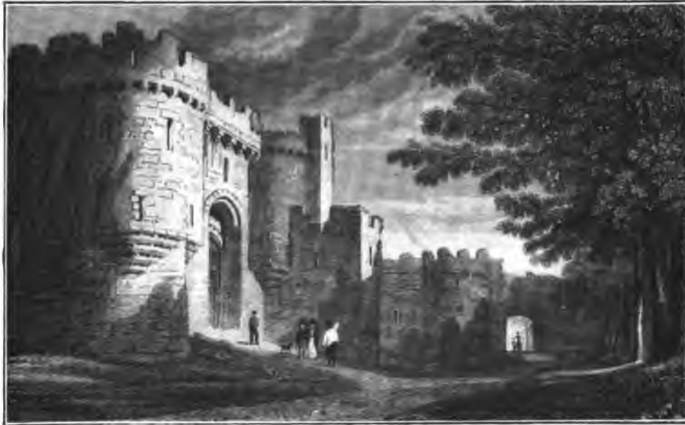
ENTRANCE TO BEAUMARIS CASTLE